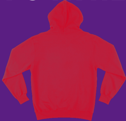
Red jumper, hoodie, cardigan