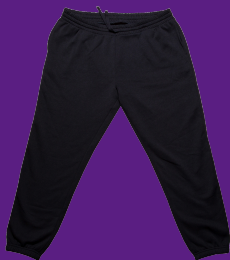
Dark bottoms/ Skirts