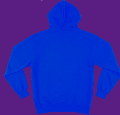
Blue jumper, hoodie, cardigan